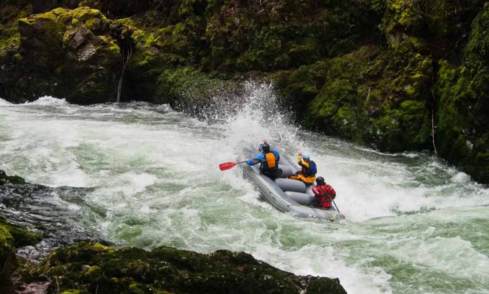
Leap of Faith hides a large hole

WASHINGTON RECREATIONAL RIVER RUNNERS PMB 501 330 SW 43rd ST. Ste K Renton, WA 98057