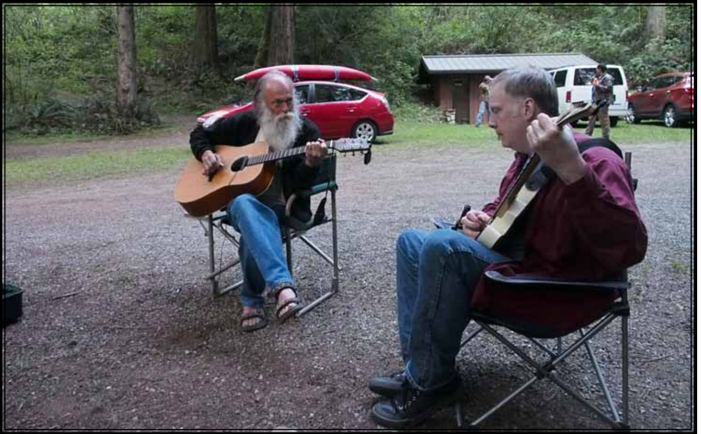
TOP: Looking upstream from Hand of God Bottom: Now sometimes we float on down the Green River..