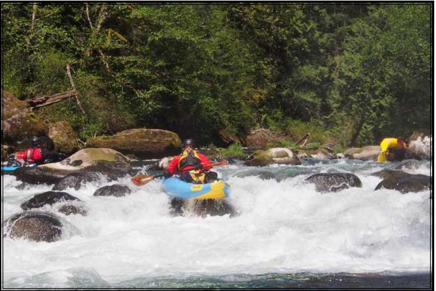
TOP: Stacey styles Pipeline Bottom: Lyles boofs, Tiger goofs.