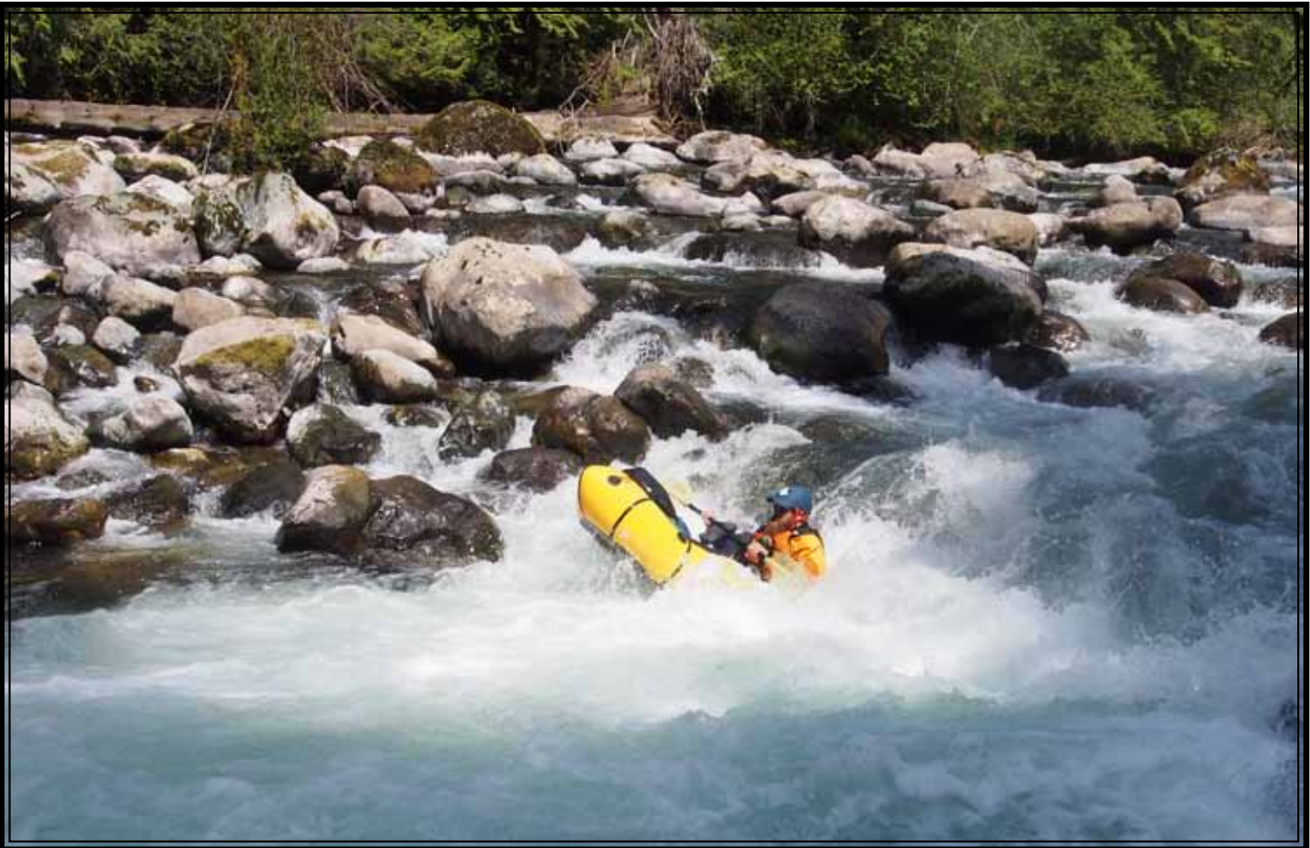
Top: Mini cat in Pipeline Bottom Brian comes through in the packraft.