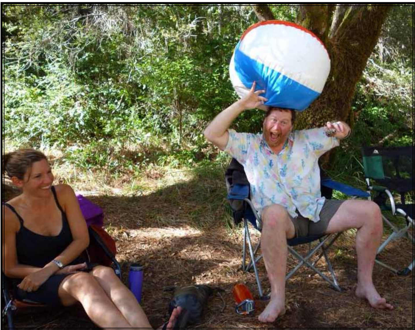
Sauk and Rogue