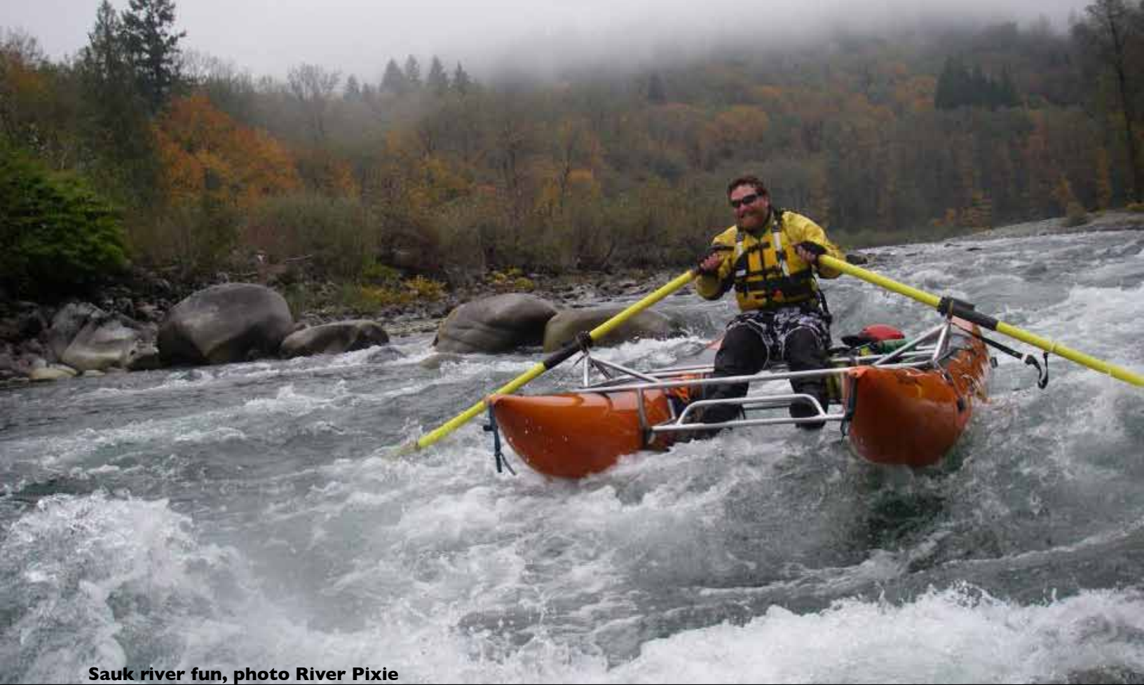
Sauk river fun