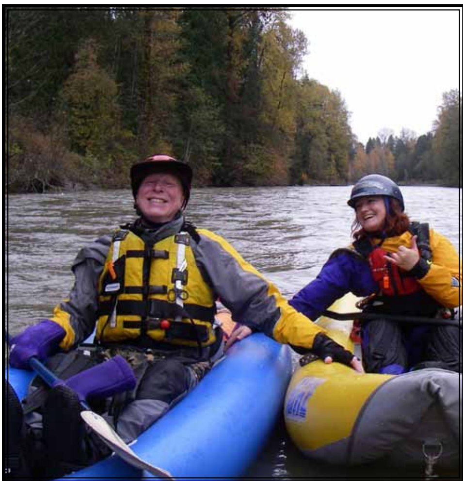
Always a smile!